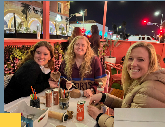
Ceramic and Sip (2022)