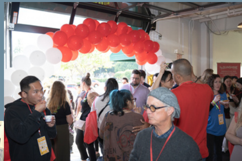
Yelp Pop-Up (2024)

We've hosted a wide range of fundraising events in our history. From gallery shows and pottery classes to food tastings, we know how to put on a fun event you won't want to miss out on!