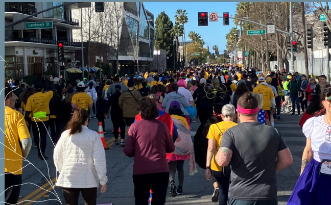
Screenland 5K (Annual)