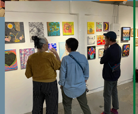
Impact of Color (2024)