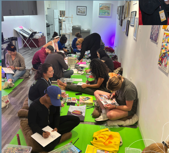
Artful Awakening (2023)